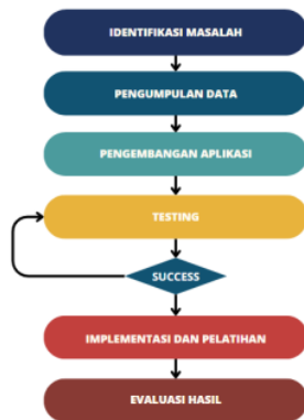
Figure 2. Framework

In achieving the research objectives, the researcher outlines the research steps as shown in Figure 1.1: