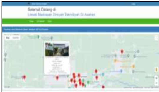
Image 2. Page Display Main User