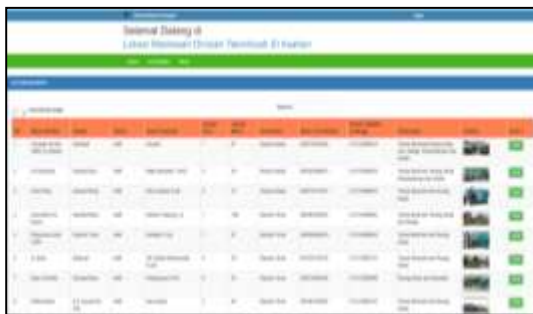
Image 3. Display of the MDTA School Data List in Asahan

The display of the school list page can be used by users to view data on school locations in Asahan District in Image 3.