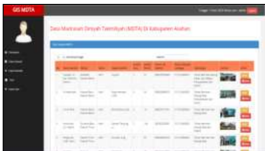
Image 7. View of the page Location of the MDTA school in Asahan

tion of the MDTA school in Asahan in Image 7.