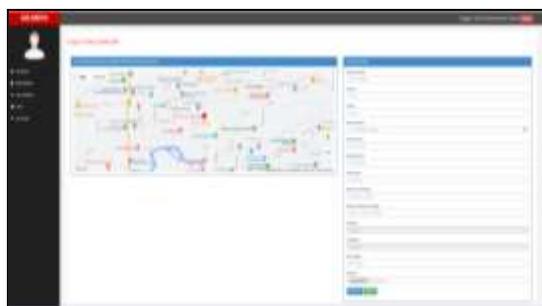
Image 8. Display of the Add Location Madrasah Location page Diniyah Takmiliyah (MDTA)

The added location display can be used by the admin to add location data for Madrasah Diniyah Takmiliyah (MDTA) in Image 8.