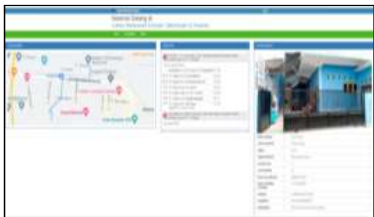
Image 4. Display of Detailed Route Pages

The display of the route page can be used by users to see the detailed route to the Madrasah Diniyah Takmiliah (MDTA) location to the location in Image 4.