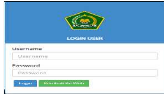
Image 5. Display of the Login Page

The login page display can be used where the admin will go through the login process to manage the system in Image 5.