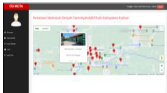
Image 6. Display of the Main Admin Page

The admin main page display can be used if the admin successfully logs in then it will enter the main admin page view in Image 6.