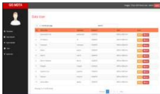
Image 9. Display of User Pages

The display of the user page that can be used to log into the MDTA mapping system in Asahan is shown in Image 9.