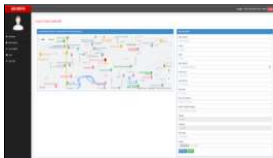
Image 10. Page Display Add User

The display of the added user page can be used by the admin in adding user data to be able to login to the website in Image 10.