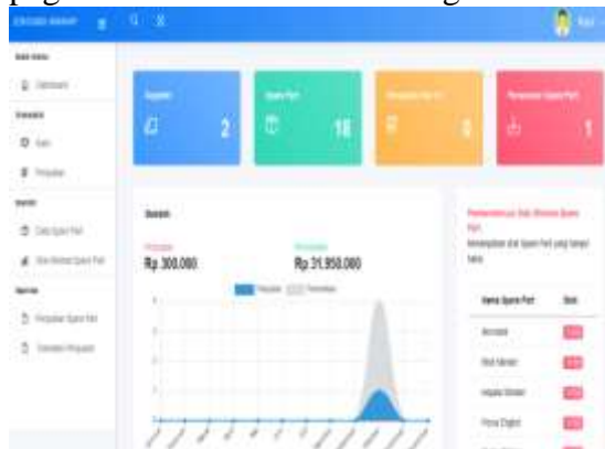
Image 8. Display of the Cashier Main Page

On this main page view, cashiers can manage sales data, print sales invoices and sales reports, and change passwords. display of the cashier's main page which can be seen in Image 8.