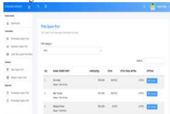
Image 6. View of the Spare Parts Supplier Bid Page

On this page, the supplier offers the spare parts they have. Display of suppliers offering spare parts can be seen in Image 6.