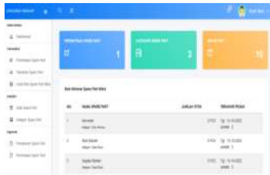
Image 4. Supplier main page

On this main page view, suppliers can manage demand and supply data, manage spare parts data, and change passwords, as shown in Image 4.