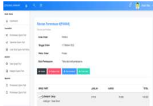
Image 5. Supplier Manages Data Retention

On this page, suppliers can manage request data such as viewing requests, sending requests, canceling orders, and printing invoices, as shown in Image 5.