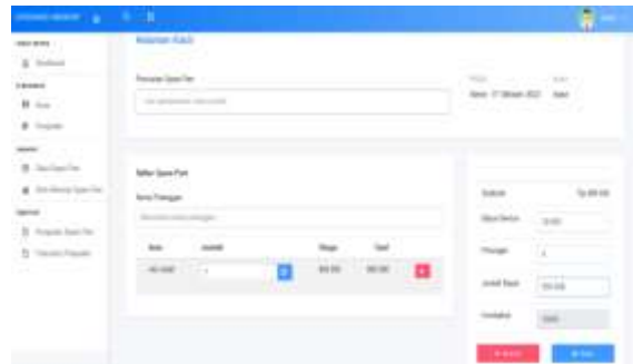
Image 9. Display of the Cashier Manage Sales page

sales data, which can be seen in Image 9.