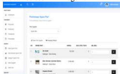
Image 2. Display of Admin Manager Request Data

In this view, admins can manage request data. view of managing request data can be seen in Image 2.