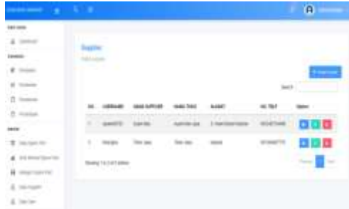
Image 3. Admin Manages Supplier Data

In this view, the admin can manage supplier data. shows how the admin manages supplier data, which can be seen in Image 3.