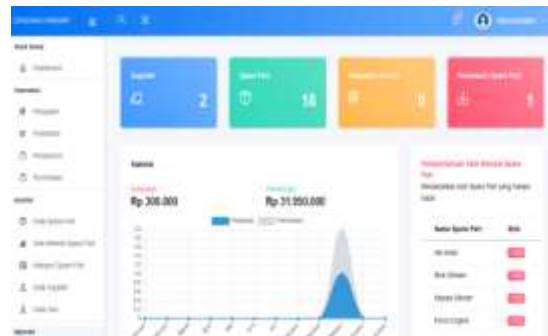
Image 1. Display of the Admin Main Menu

On the main page display the admin can manage request data, approve offers, manage spare part data, manage supplier data and manage user data, can be seen in Image 1.