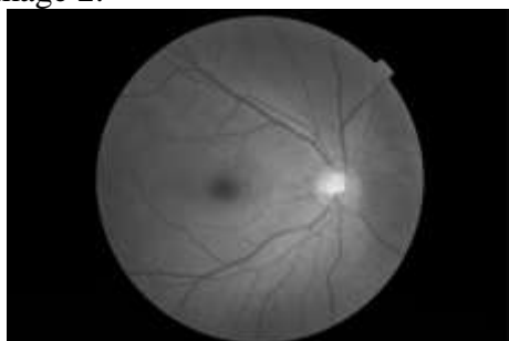
Image 2. Gray Imagery Retina

The data obtained will be converted into gray using the Matlab toolbox with rgb2gray(img) coding. The result of the conversion of gray imagery can be seen in Image 2.