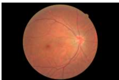
Image 1. Retina Image

The data used are retinal glaucoma and normal images. An example of the retinal image used can be seen in Image 1.