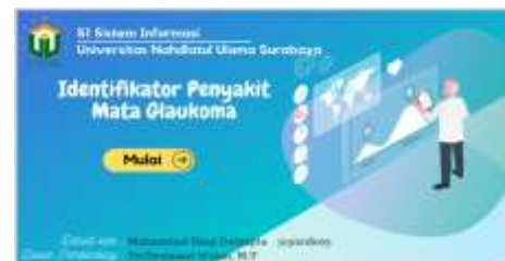
Image 4. Main View

the main display on the application contains some information about the origin of the agency and study program of the system maker, the title of the system, the name of the maker and the start button.