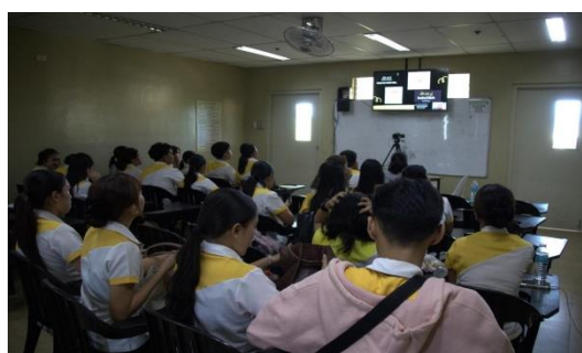
Figure 3. Active Participation from Students at Misamis University