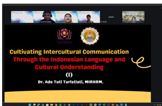
Figure 2. Training via Zoom Meeting

Sustainable Development Goals (SDGs), particularly SDG 4: Quality Education, which aims to ensure inclusive and equitable quality education and promote lifelong learning opportunities for all. The data indicate that most respondents possess positive perceptions regarding their learning abilities and engagement, with 80% reporting that they are capable of performing the task, 84% stating that they understand and learn the material, and 92% recognising the relevance and importance of the content. These findings suggest that the learning process effectively fosters cognitive understanding, learner confidence, and meaningful engagement, which are key indicators of quality education.