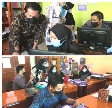
Figure 3. Implementation of Mentoring

activity was mentoring the teachers which was carried out on July 1, 2022. The mentors assisted the teachers in utilizing the wordwall application that has been created.