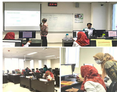
Figure 2. Implementation of Interactive Learning Media Training

The results indicate raise in the post-test score appealed to the pre-test score of all participants. The graph explains that 100% of the training participants are able to use interactive learning media application of wordwall. The implementation of training related to interactive learning media and the adopt of technology can be seen in Figure 2.